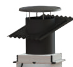
Chimney with PVH