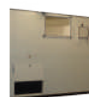
Pop-hole on sandwich panel dimensions